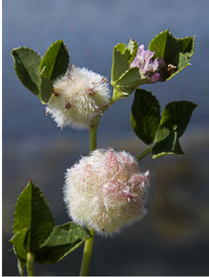
STRAWBERRY CLOVER ( Trifolium fragiferum ) Naturalized Perennial - Pea Family - (Late spring) - Roadsides, gen in saline soil - Head bracts 0.08" long, green. Flowers pink, 0.2-0.24" long, quickly hidden by hairy inflated flower bracts.