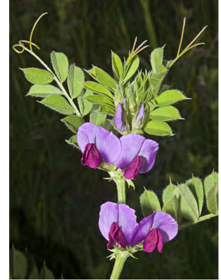
SPRING VETCH ( Vicia sativa subsp. sativa ) Naturalized Annual - Pea Family - (Mar-Jun) - Roadsides, disturbed areas, grassland, open areas in oak and riparian woodlands - Flowers 1-2 at leaf bases, pink-purple to white, 0.7-1.2" long. Leaflets 0.16-0.4" wide.