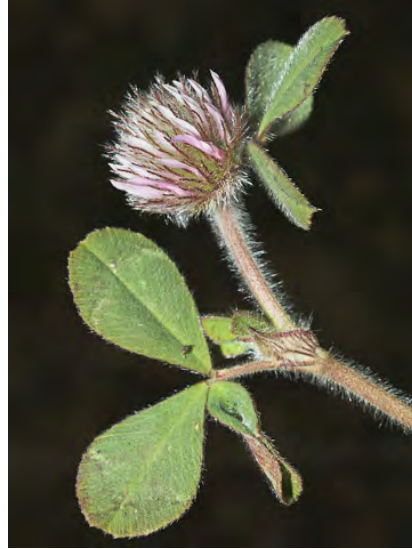
ROSE CLOVER ( Trifolium hirtum ) Naturalized Annual - Pea Family - (Apr-May) - Disturbed areas, roadsides - Head with 1-2 bract-like leaves immed below. Flowers pink, 0.4-0.6" long, densely-bristly in fruit. INVASIVE weed.