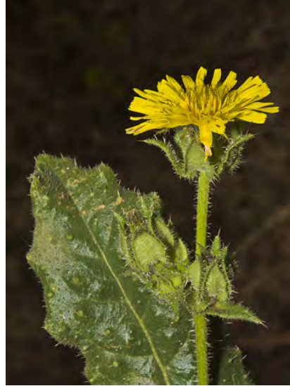
BRISTLY OX-TONGUE ( Helminthotheca echioides ) Naturalized Annual-Biennial - Sunflower Family - (All year) - Common. Disturbed areas - Stem 1-6.5' tall, bristly. Leaf 2-8" long, covered with prickly bumps. Flower heads 0.8-1.6" wide. INVASIVE weed.