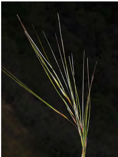
PURPLE NEEDLE GRASS ( Stipa pulchra ) Native Perennial - Grass Family - (Mar-Jun) - Oak woodland, chaparral, grassland - Stem 14-39" long. Leaf blade 4-8" long. Glumes 0.5-0.8" long, ~equal. Awn 1.6-4" long, last segment straight.