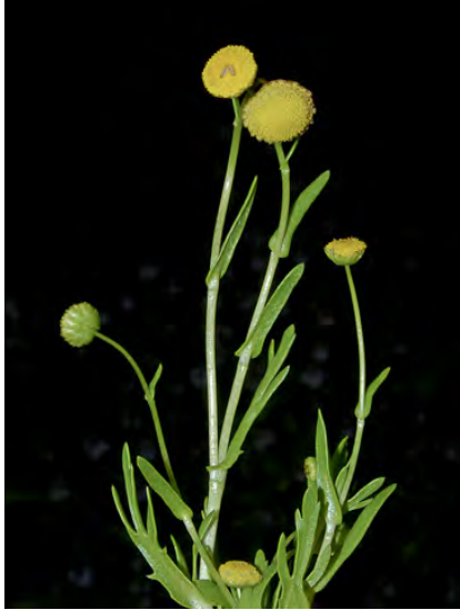
BRASS-BUTTONS ( Cotula coronopifolia ) Naturalized Perennial - Sunflower Family - (Mar-Dec) - Common. Saline and freshwater marshes, mud flats - Plant 2-16"+ tall, smooth, ± fleshy. Leaves linear to lance-shaped w/linear teeth or lobes. INVASIVE.