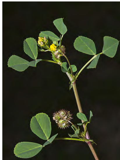
CALIFORNIA BURCLOVER ( Medicago polymorpha ) Naturalized Annual - Pea Family - (Mar-Jul) - Common. Chaparral, oak woodland, streambanks, roadsides, disturbed areas - Stem 4-20". Flower yellow, 0.14-0.24" long. Spiny spiral fruits. INVASIVE .