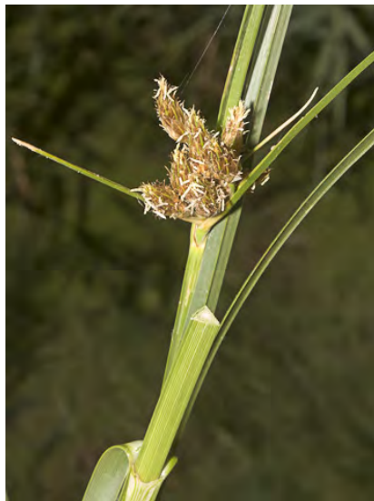
SEACOAST BULRUSH ( Bolboschoenus robustus ) Native Perennial - Sedge Family - (Summer) - Brackish to saline coastal marshes - Plant 20-60" tall. Stem sharply triangular. Flower cluster dense, stemless, just above bracts. Spikelets 5-25, 0.4-1.2" long.