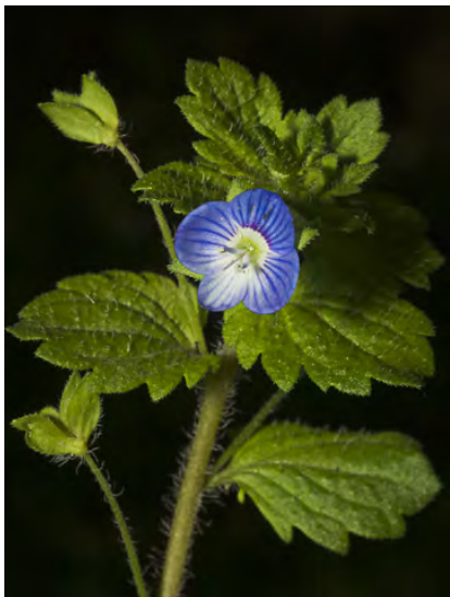
PERSIAN SPEEDWELL ( Veronica persica ) Naturalized Annual - Plantain Family - (Feb-May) - Wet, disturbed areas, fields - Stem 2-24" long, crawling. Flowers on 0.6-1.2" long stalks. Flowers blue, purple-lined with a white center.