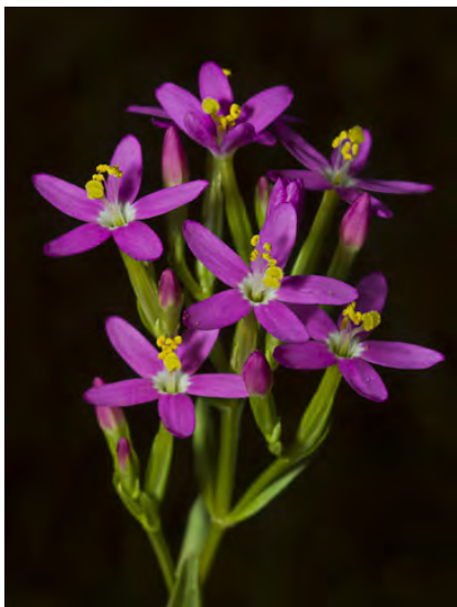
MONTEREY CENTAURY ( Zeltnera muelenbergii ) Native Annual-Biennial - Gentian Family - (Jun-Aug) - Moist coastal bluffs, forest openings - Plant 1.2-12" tall. Leaf 0.6-1" long. Flowers pink, 0.5-0.75" mm long, lobes 0.08-0.28" long; flower stalk < 0.0" long.