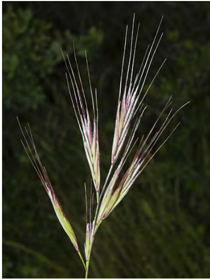
FOXTAIL CHESS ( Bromus madritensis subsp. madritensis ) Naturalized Annual - Grass Family - (Apr–Jan) - Disturbed areas, roadsides - Plants 4-20" tall. Stem and sheathes smooth. Flower cluster branches visible, lower spikelets erect, > stalk.