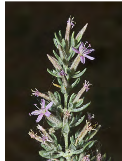
ALKALI HEATH ( Frankenia salina ) Native Perennial - Frankenia Family - (Apr-Sep) - Salt marshes, alkali flats - Matted subshrub, to 1' tall. Leaf blade 0.16-0.6" long, <= 0.24" wide. Petals white to pink or blue-purple, 0.24-0.55" long; gen 6 stamens.