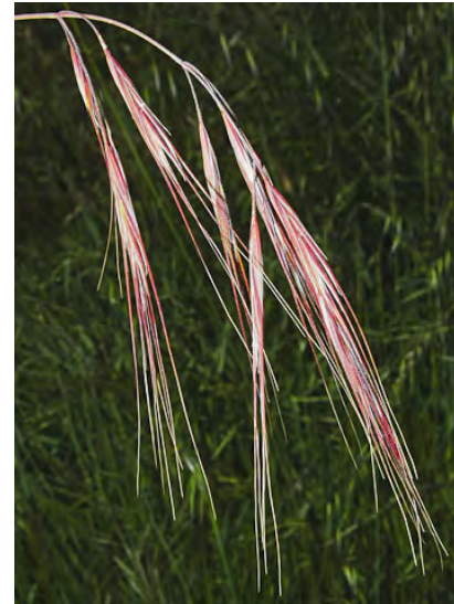
RIPGUT GRASS ( Bromus diandrus ) Naturalized Annual - Grass Family - (Apr-Jul) - Open, gen disturbed areas - Plant 6-40" tall. Spikelet 1-2.8" long. Lemma body 0.8-1.2" long, awn > 1.2" long. Barbed seeds can stick in flesh of animals. INVASIVE weed.