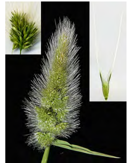
RABBITFOOT GRASS ( Polygogon monspeliensis ) Naturalized Annual - Grass Family - (Apr–Aug) - Moist places, along streams - Stem 8-39". Leaf 0.4-8" long, 0.16-0.24" wide. Flower cluster 0.4-6.7" long, plume-like. Glume awn > 0.14". Lemma awn gen < 0.1". INVASIVE.