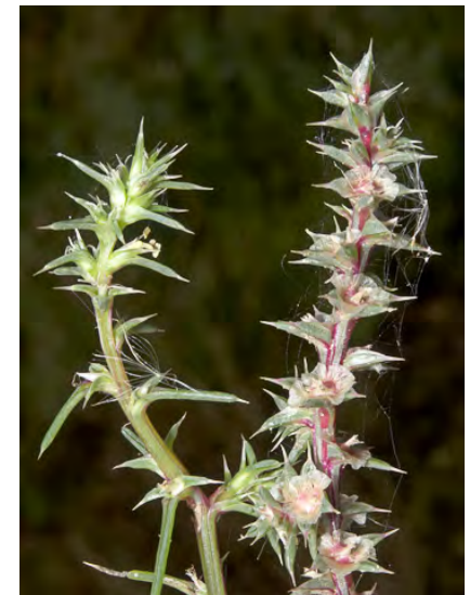
RUSSIAN THISTLE ( Salsola tragus ) Naturalized Annual-Perennial - Goosefoot Family - (Jul-Oct) - Common. Disturbed places - Plant < 5' tall. Stem gen red-striped, widely branched. Leaves succulent, 0.3-2" long, upper spine-tipped. NOXIOUS.