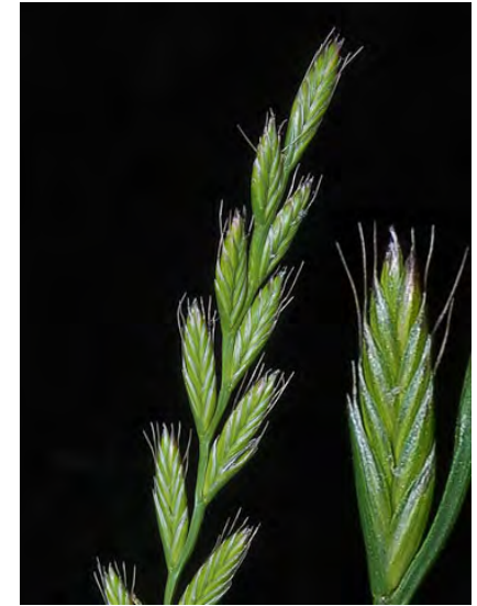
RYE GRASS ( Festuca perennis ) Naturalized Perennial - Grass Family - (May–Sep) - Dry to moist disturbed sites, abandoned fields - Stem 20-40" tall. Spikelet 0.2-0.9" long, > glume, awned or awnless. Sterile shoots at base. INVASIVE weed.