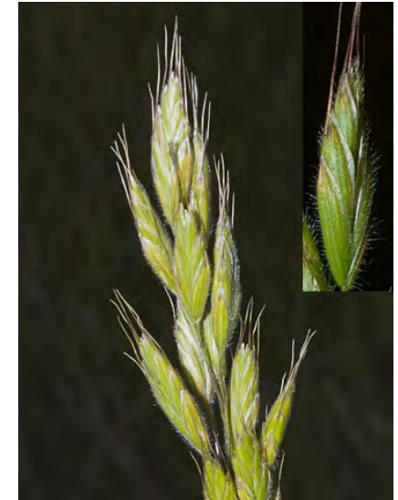
SOFT CHESS ( Bromus hordeaceus ) Naturalized Annual - Grass Family - (Apr-Jul) - Fields, disturbed areas - Plant 4-26" tall. Leaf hairy. Flower cluster 1-5" long, dense, some stalks > spikelet. Spikelet 0.5-0.9". Lemma 0.26-0.4", awn 0.16-0.4". INVASIVE weed.