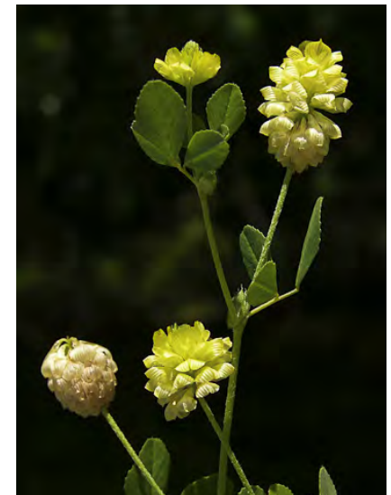
HOP CLOVER ( Trifolium campestre ) Naturalized Annual - Pea Family - (Apr-May) - Disturbed areas, roadsides - Flower heads 0.3-0.5" wide, bright yellow, brown w/age, quickly reflexing. Flowers with lengthwise ridges.