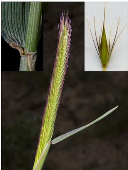
NORTHERN BARLEY ( Hordeum brachyantherum subsp. brachyantherum ) Native Perennial - Grass Family - (May–Aug) - Meadows, pastures, streambanks - Stem 1-3' tall, gen robust. Leaf sheaths gen smooth, blade < 7.5" long. Lemma awn < 0.25".