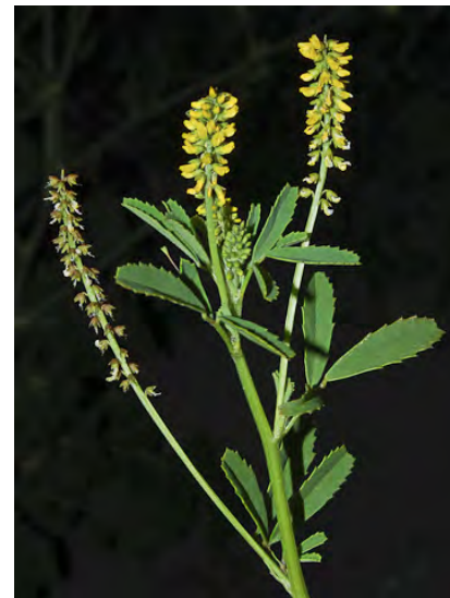
SOURCLOVER ( Melilotus indicus ) Naturalized Annual-Biennial - Pea Family - (Apr-Oct) - Open, disturbed areas - Stem 4-24" long. Leaflets 3, 0.4-1" long. Flowers yellow, ~0.1" long.