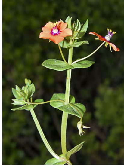
SCARLET PIMPERNEL ( Anagallis arvensis ) Naturalized Annual - Myrsine Family - (Mar-May) - Common. Disturbed places, ocean beaches - Plants 2-16" tall. Flowers 0.2-0.3" long, salmon or occasionally blue. Leaves TOXIC , can cause dermatitis.