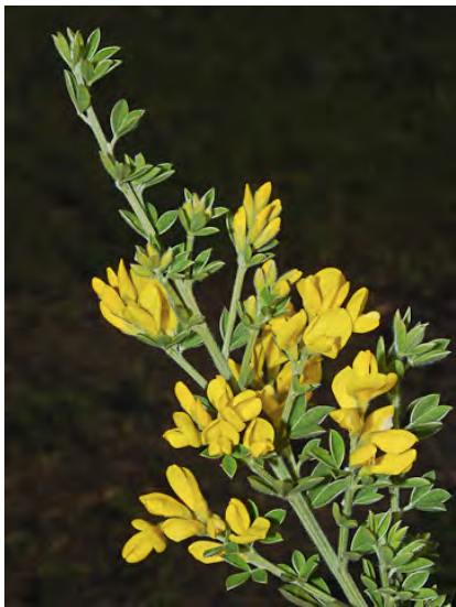
FRENCH BROOM ( Genista monspessulana ) Naturalized Perennial - Pea Family - (Mar-Jun) - Common. Disturbed places. - Shrub < 10' tall, evergreen. Stems 8-10 ridged, leafy. Flowers yellow, 4-10 at branch tips, banner 0.4-0.6" long. NOXIOUS.