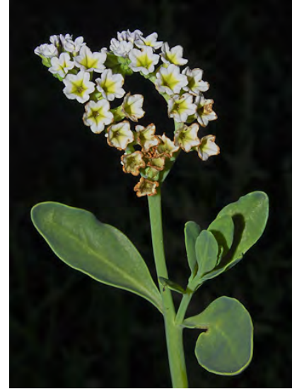
SEASIDE HELIOTROPE ( Heliotropium curassavicum var. oculatum ) Native Perennial - Borage Family - (Feb-Oct) - Moist to dry, saline to alkaline soils, gen near water - Plant fleshy. Leaf 0.4-2.4 cm long. Flowers white w/ yellow center, 0.12-0.2" long.