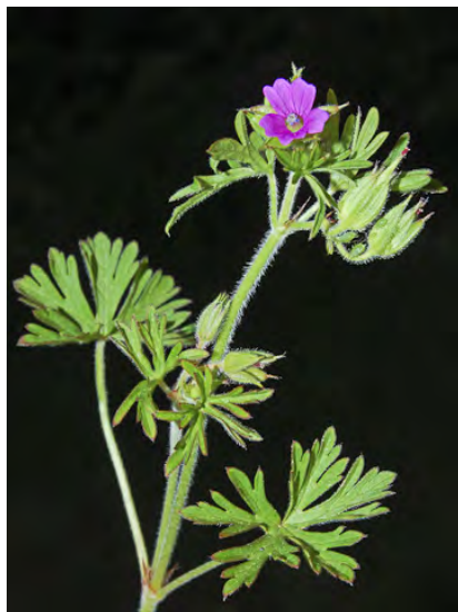
CUT-LEAVED GERANIUM ( Geranium dissectum ) Naturalized Annual - Geranium Family - (Mar-Jul) - Open, disturbed sites - Stem 3-28" tall, rough-hairy. Leaf blades deeply divided. Petals violet-red, 0.1-0.25" long w/notched tips. Flower stalk sticky. INVASIVE.