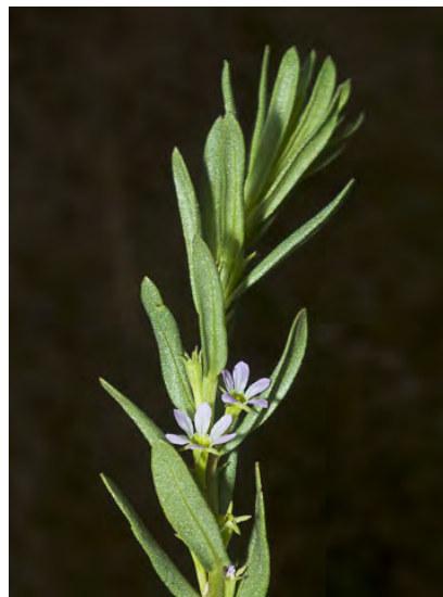
GRASS-POLY ( Lythrum hyssopifolia ) Naturalized Annual-Perennial - Loosestribe Family - (Apr-Oct) - Marshes, drying pond margins, disturbed ground - Stem 4-24". Leaves 0.2-1.2" long, ~elliptical. Petals pink, 0.1-0.2" long. 2 awl-like appendages. INVASIVE weed.