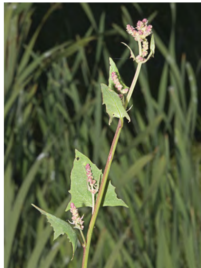
FAT-HEN ( Atriplex prostrata ) Native Annual - Goosefoot Family - (Apr-Oct) - Wet places, marshes - Plant 4-48" tall, branched at base. Leaves alternate, blades 0.4-3.5" long, triangular, green, not dense-scaly underneath.