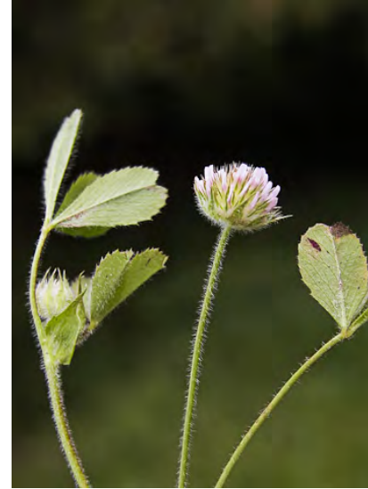
SMALL-HEAD CLOVER ( Trifolium microcephalum ) Native Annual - Pea Family - (Apr-Aug) - Streambanks, moist, disturbed areas, roadsides, serpentine, conifer forest - Hairy. Head bract cup-like. Flowers pink to lavender, calyx lobes smooth-edged, > flowers.