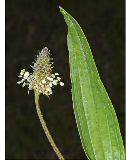
ENGLISH PLANTAIN ( Plantago lanceolata ) Naturalized Annual - Plantain Family - (Apr-Aug) - Common. Disturbed areas - Leaves basal, hairy, 2-10" long, <= 1" wide. Flowers + stem 8-31" tall, flower cluster 0.8-3" long. INVASIVE , lawn weed.