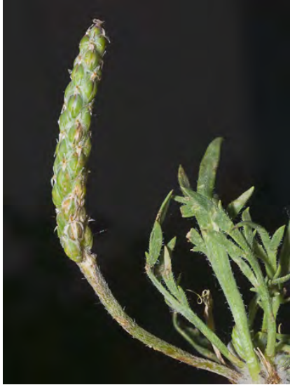
CUT-LEAF PLANTAIN ( Plantago coronopus ) Native Annual-Biennial - Plantain Family - (Apr-Jul) - Coastal bluffs, salt marshes, trampled places, chaparral, grassy flats - Leaves 1.6-10" long, tooth-like lobes. Flower: stems 1-6, 2-20" tall, cluster 0.8-8" long.