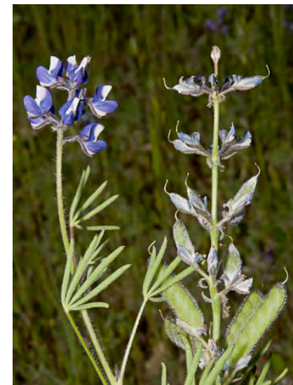
MINIATURE LUPINE ( Lupinus bicolor ) Native Annual - Pea Family - (Mar-Jun) - Abundant. Open or disturbed areas - Plant 4-16", hairy. Flower 0.16-0.4" long, banner longer than wide, upper keel ciliate near tip, pedicel < 0.12". Fruit 0.12-0.24" wide.