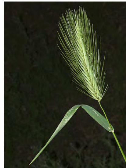
HARE BARLEY ( Hordeum murinum subsp. leporinum ) Naturalized Annual - Grass Family - (Feb–May) - Moist, gen disturbed sites. Common - Stem 12-43" tall. Central spikelet stalk ~0.06" long. Central floret << lateral florets. INVASIVE weed.