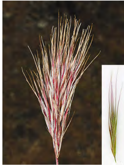
RED BROME ( Bromus madritensis subsp. rubens ) Naturalized Annual - Grass Family - (Mar–Jun) - Disturbed areas, roadsides - Plant 4-20". Flower cluster condensed, branches obscure, < spikelets. Stem & sheathes hairy. INVASIVE weed.