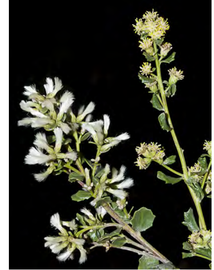
COYOTE BRUSH ( Baccharis pilularis subsp. consanguinea ) Native Perennial - Sunflower Family - (Jul-Dec) - Coastal bluffs, woodland, grassland, disturbed sites, occ on serpentine - Shrub < 15' tall, brittle, common. Leaves gen 0.6-1.6" long.