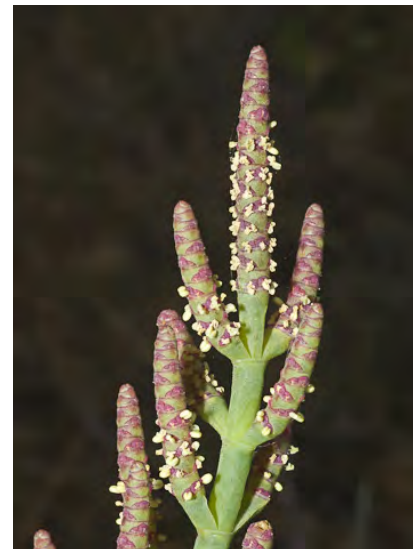
PACIFIC PICKLEWEED ( Salicornia pacifica ) Native Perennial - Goosefoot Family - (Jul-Nov) - Salt marshes, alkaline flats - Plant 4-28" tall, branching from base, branches opposite. Flower clusters 0.8-3.3" long, 0.1-0.2" wide.