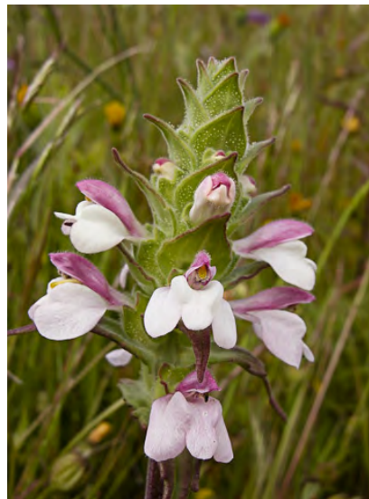
MEDITERRANEAN LINSEED ( Bellardia trixago ) Naturalized Annual - Broom-rape Family - (Apr-Jun) - Disturbed grassland. - Plant sticky-hairy. Stem 6-32" tall. Leaves lance-shaped, toothed. Flowers 0.8-1" long, 2-lipped: upper lip pink, lower lip white. INVASIVE.