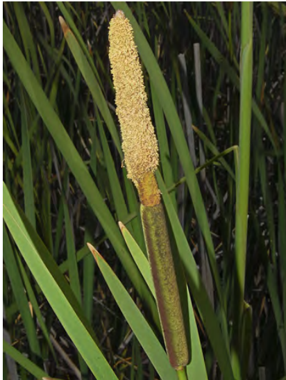
BROAD-LEAVED CATTAIL ( Typha latifolia ) Native Perennial - Cattail Family - (Jun-Jul) - Unpolluted to nutrient-rich freshwater (brackish) marshes - Plant 4.9-9.8' tall. Widest leaves 0.4-1.1" wide. Flower cluster with no gap between flower types.