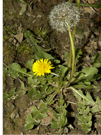
COMMON DANDELION ( Taraxacum officinale ) Naturalized Biennial-Perennial - Sunflower Family - (All year) - Abundant. Esp disturbed areas - Stem hollow. Leaves bright green with sharp down-pointing lobes. Outer head bracts reflexed. Fruit ~ brown.