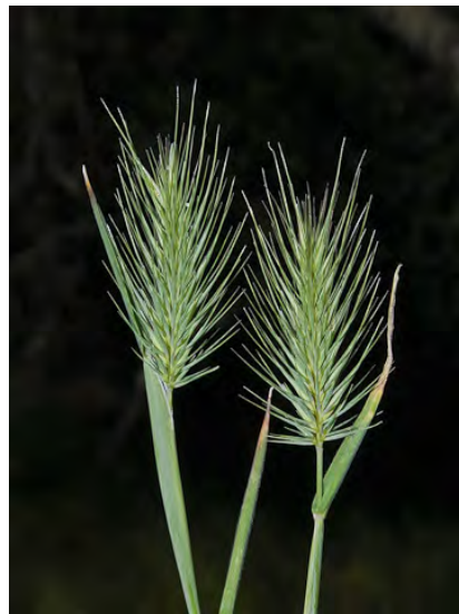
MEDITERRANEAN BARLEY ( Hordeum marinum subsp. gussoneanum ) Naturalized Annual - Grass Family - (Apr–Jun) - Dry to moist, disturbed sites - Stem 4-20". Leaf blades to 32" long, auricles < 0.08". Central lemma awn 0.25-0.7" long. INVASIVE weed.