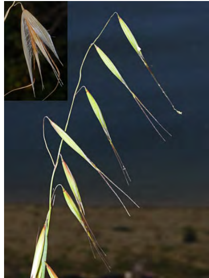
SLENDER WILD OAT ( Avena barbata ) Naturalized Annual - Grass Family - (Mar-Jun) - Disturbed sites - Plants gen 24-32". Spikelets 0.8-1.2" long. Awns 0.8-1.8" long. Lemma tip bristles >= 0.1" long. Seeds EDIBLE whole or ground for flour. INVASIVE weed.