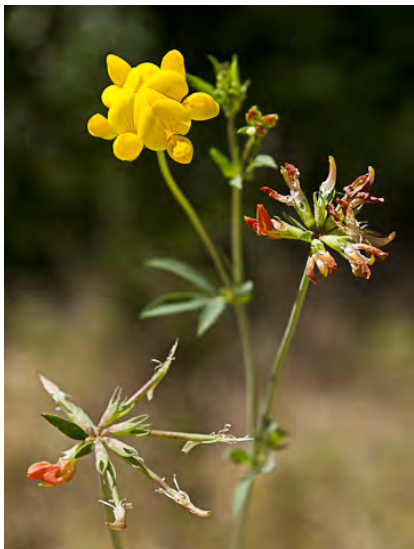
BIRD'S-FOOT TREFOIL ( Lotus corniculatus ) Naturalized Perennial - Pea Family - (Jun-Sep) - Open, disturbed areas - Leaflets 5, 0.16-0.9" long. Flower cluster 3-7 flowered on 0.6-4.7" stalk. Flowers bright yellow, 0.4-0.55" long, banner often reddish.